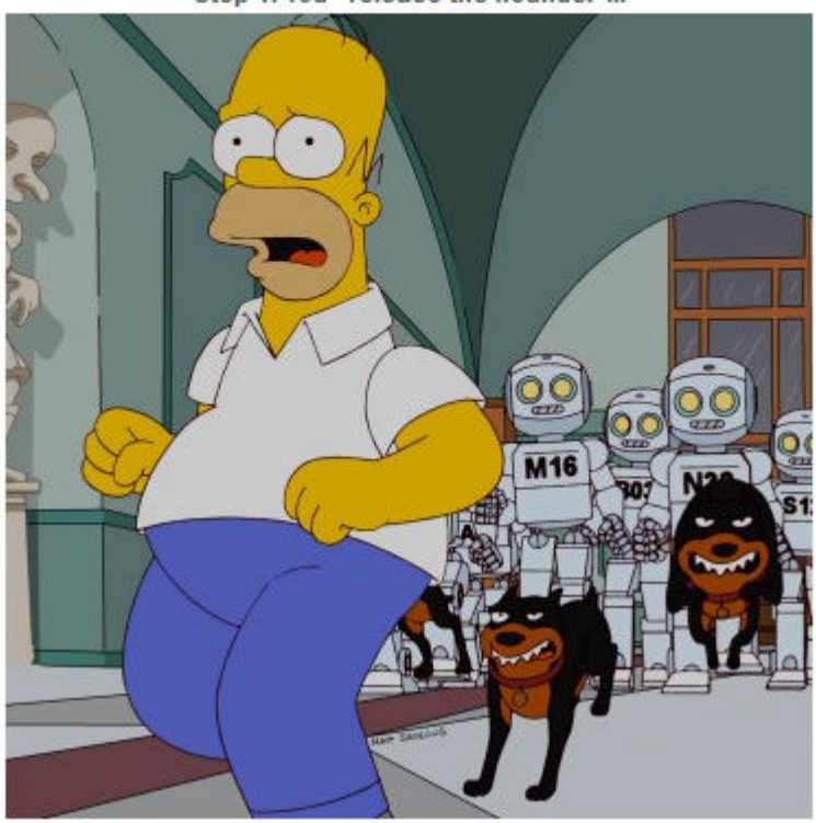
Step 1: You "release the hounds!"...