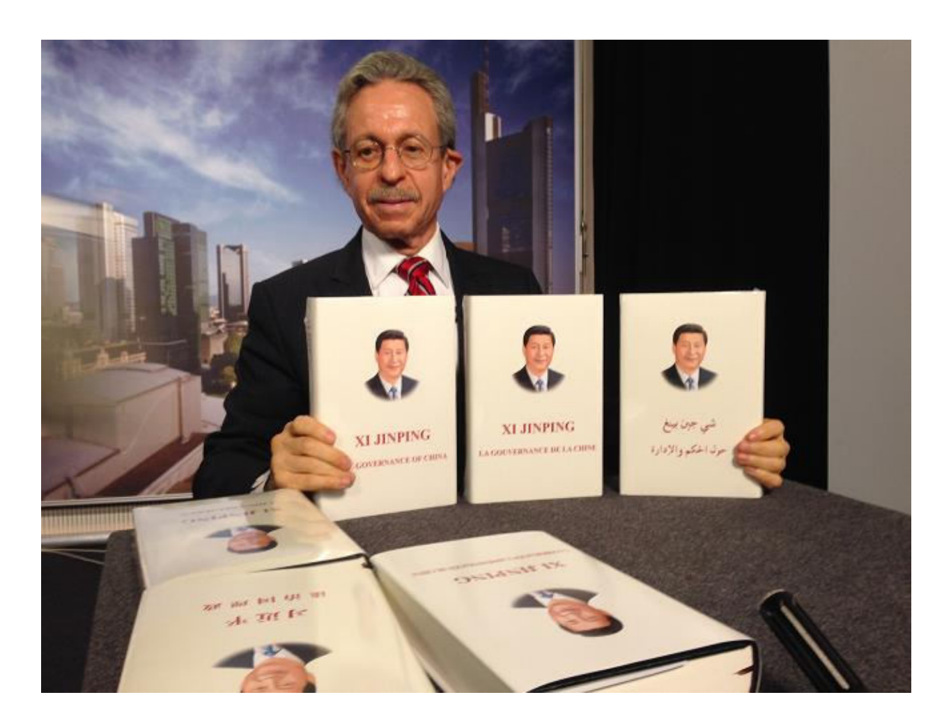
The NWO Strategy in Pictures